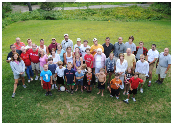
Family Campers 2010

ON August 20, 2011 - We are excited to celebrate Birch Rock's 85th Anniversary. In addition to this historic milestone, we are pleased to open up our annual BRC FAMILY CAMP program to prospective families, alumni and friends from August 19 to 23. So come join us.....for our 85th Celebration Day and/or the Family Camp extended weekend. You'll be glad that you did! For more information about our 85th Anniversary and Family Camp, please visit us at www.birchrock.org or (207) 741-2930.